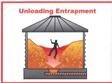
The only way safe way to avoid being drawn into a column of flowing grain is to never enter a bin while it is unloading.

Besides suffocation, the victim is also at risk of continuing to sink to the floor or outlet and becoming entangled in the unloading auger. Survivors of entrapments and engulfments have often underestimated the tremendous force of the grain.